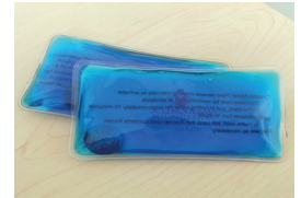
Gel Hand Warmers $5 pair