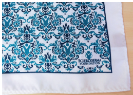
36" x 36" Ladies SF Damask Pattern Scarf $28 each