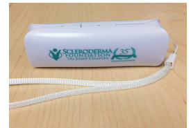
Flashlight / Rechargeable Portable Power Bank $5 each