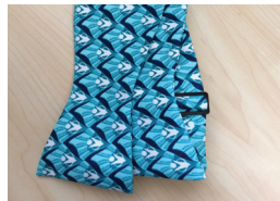
Adult SF Shell Pattern Self-tie Bow Tie $25 each