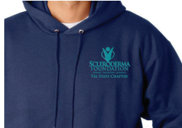
Navy Hoodie $25 each