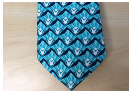
Adult SF Shell Pattern Neck Tie $25 each