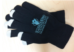
Touchscreen Gloves $8 each