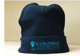
Navy Knit Hat $18 each