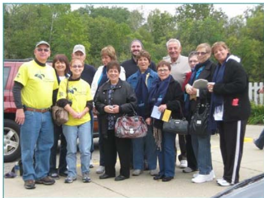
7 th Annual Reynoldsburg (Columbus/Dublin) Walk