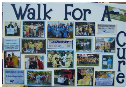
“Walk for a Cure” Boardman Walk 2010