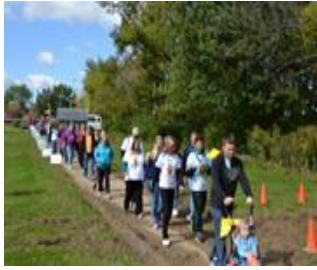
Walking for a Cure – Reynoldsburg