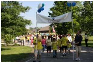
Walking for a Cure - Boardman

We are so proud of the Boardman Ohio Fun-Walk, it has been 8 years now and they have raised over $300,000. What a machine! With over 40 volunteers and 10 committee Chairpersons, everyone knows what to do and you can count on each one. As they've told us, the generous sponsors