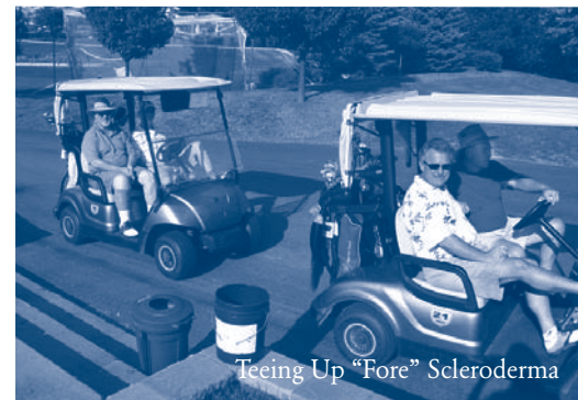
Teeing Up "Fore" Scleroderma