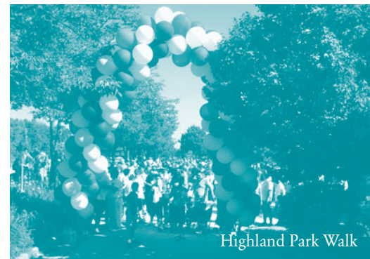
Highland Park Walk