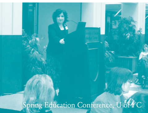
Spring Education Conference, U of C