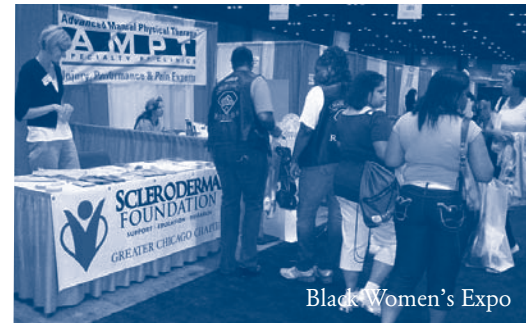
Black Women's Expo