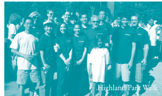
Highland Park Walk