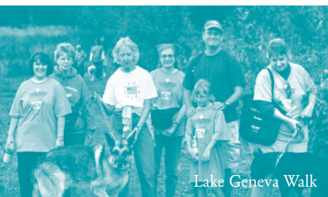
Lake Geneva Walk