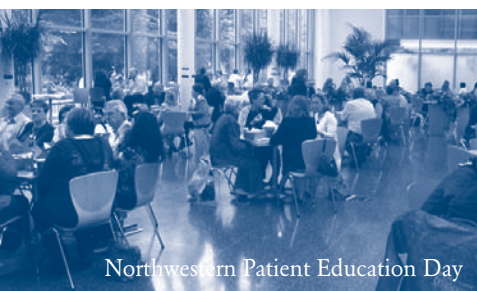
Northwestern Patient Education Day