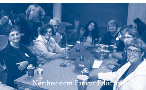
Northwestern Patient Education Day